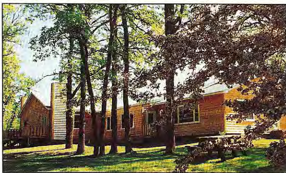
During the winter, the grounds of the Lady Slipper Inn are perfect for cross-country skiing.

For dinner, enjoy fireside dining at Finn and Sawyers overlooking the Mississippi River at Levee Park. If you and your partner are fish or seafood lovers,